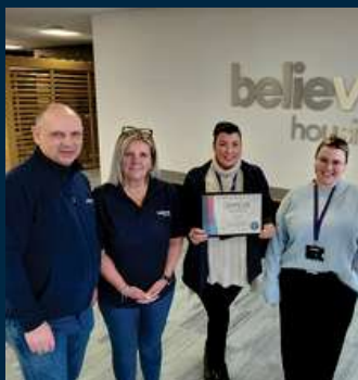
The team at Believe Housing

Citizens Advice Sandwell & Walsall. Norfolk First Credit Union has also been awarded partner recognition along with Believe Housing based in Seaham, County Durham. All organisations that achieve partner recognition have gone above and beyond to support the work of Stop Loan Sharks. It's great to have you all working with us to help keep people safe from loan sharks – we couldn't do it without you!